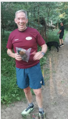
A triumphant Rampant with Foxy's Beaver. Willow and WetWipe in the background look for a place to wee.