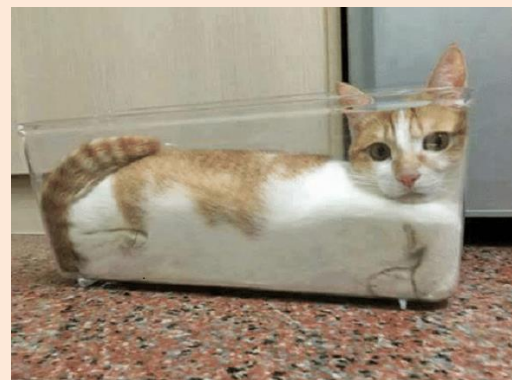
Further proof cats are liquid.

Here's a little something to brighten the mood.